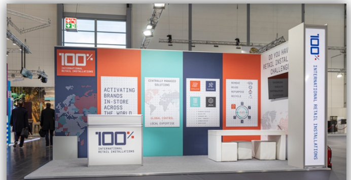
18 sqm with individual booth construction