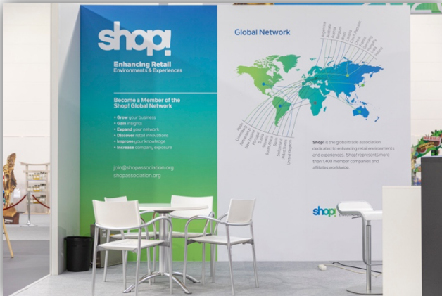
12 sqm complete package with standard booth construction and extra artwork