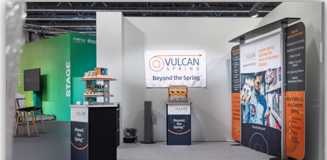
12 sqm complete package with standard booth construction and decoration by exhibitor